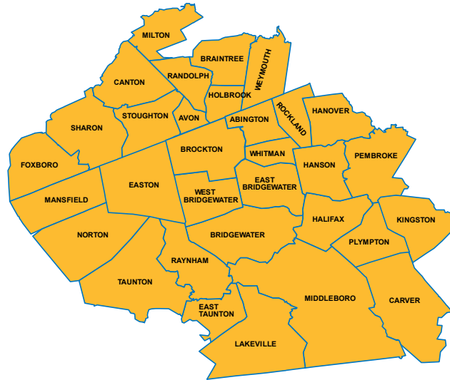
Our Service Area Please call for availability in outlying areas

We invite you to look at the enclosed guide to help you choose the services that can best help you achieve your goals.